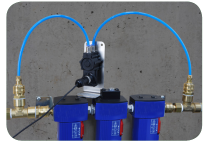
Typical operation of the differential pressure sensor: Connection with two PE hoses before and after the filter element.