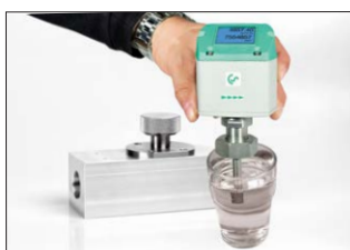
The sensor can be removed from the measuring section and cleaned.